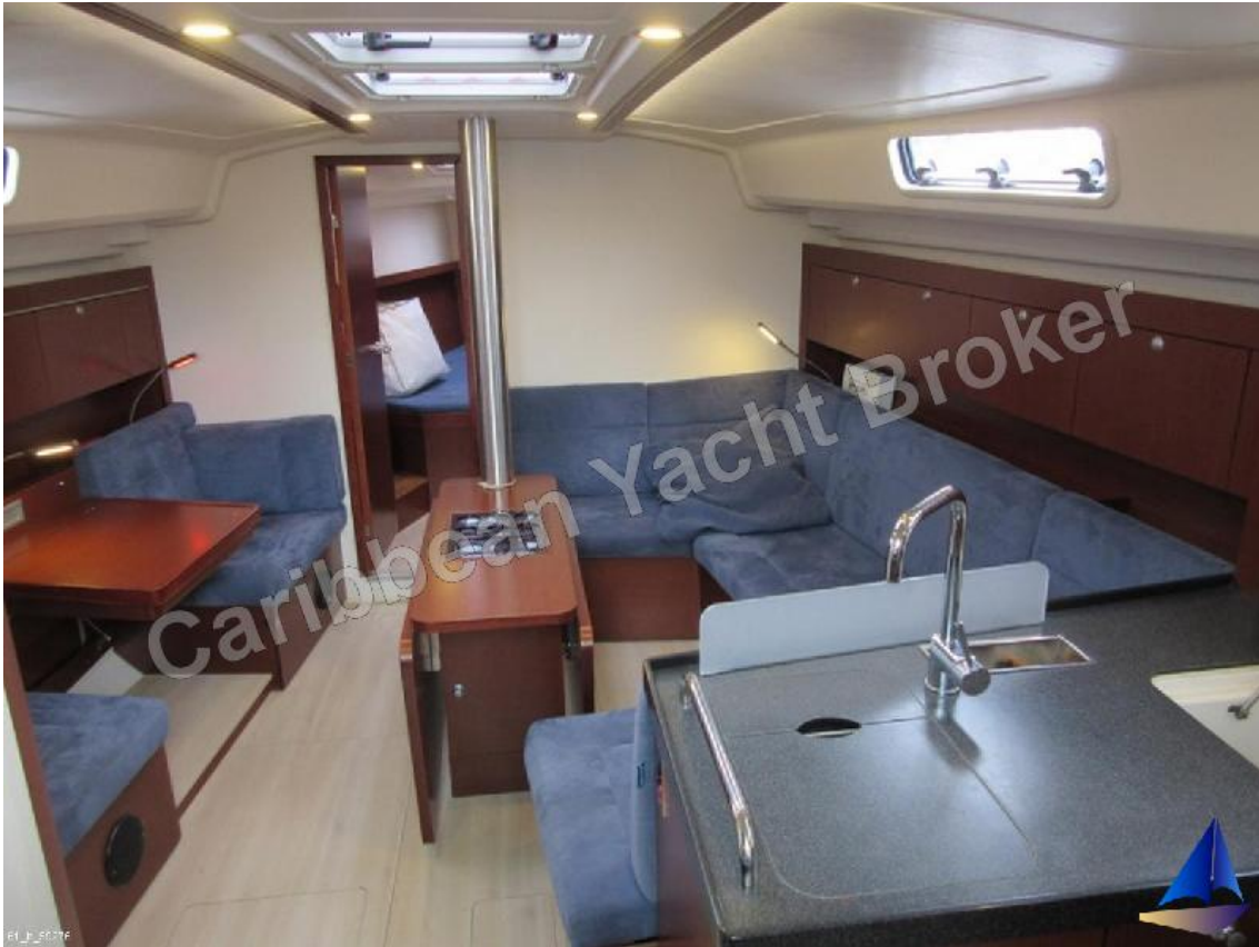
Galley / Hanse 415 - 2015