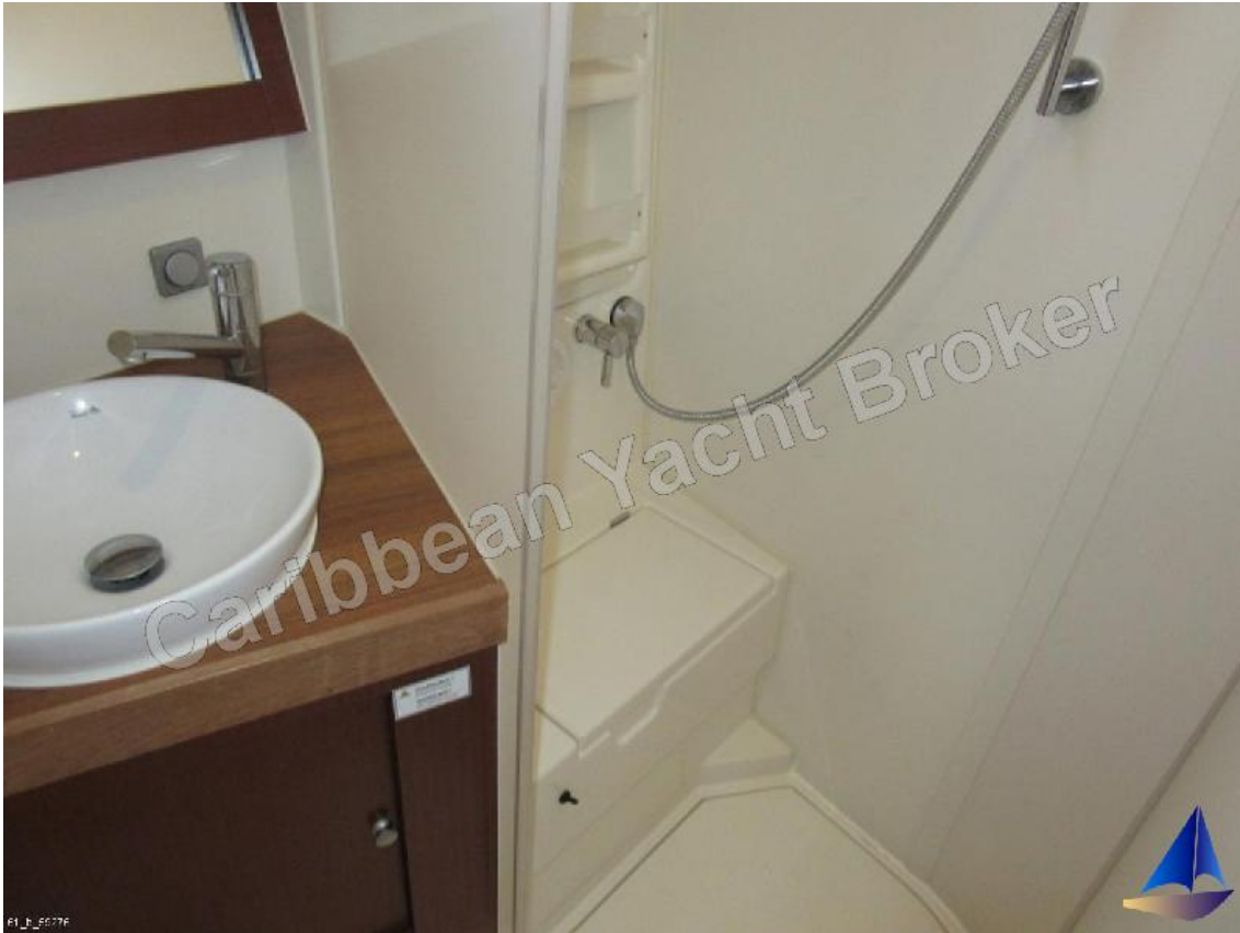
Bath / Toilet / Hanse 415 - 2015