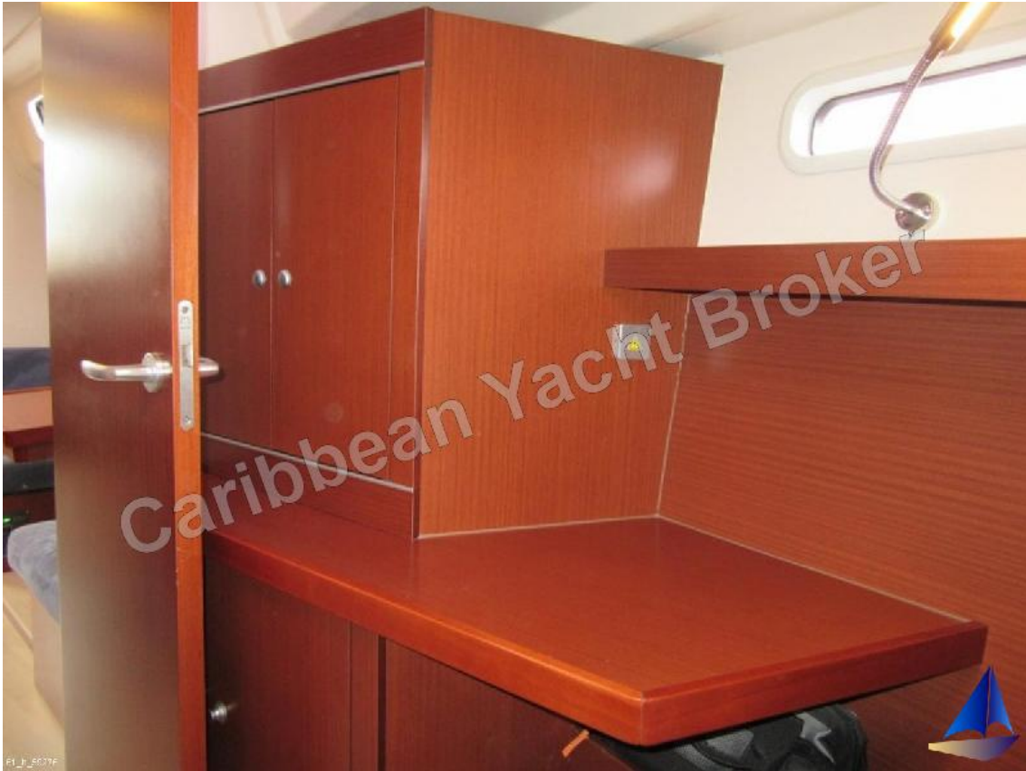
Cabin / Hanse 415 - 2015