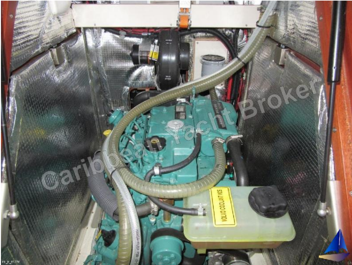
Layout / Hanse 415 - 2015