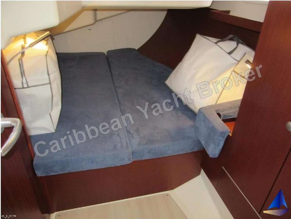
Cabin / Hanse 415 - 2015