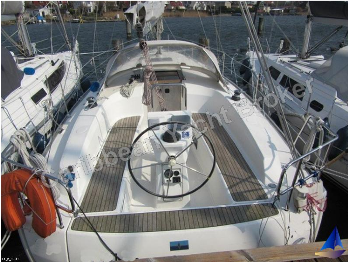
Bavaria Cruiser 32 - 2012