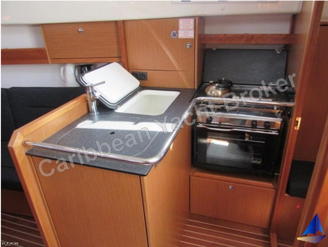
Cabin / Bavaria Cruiser 32 - 2012