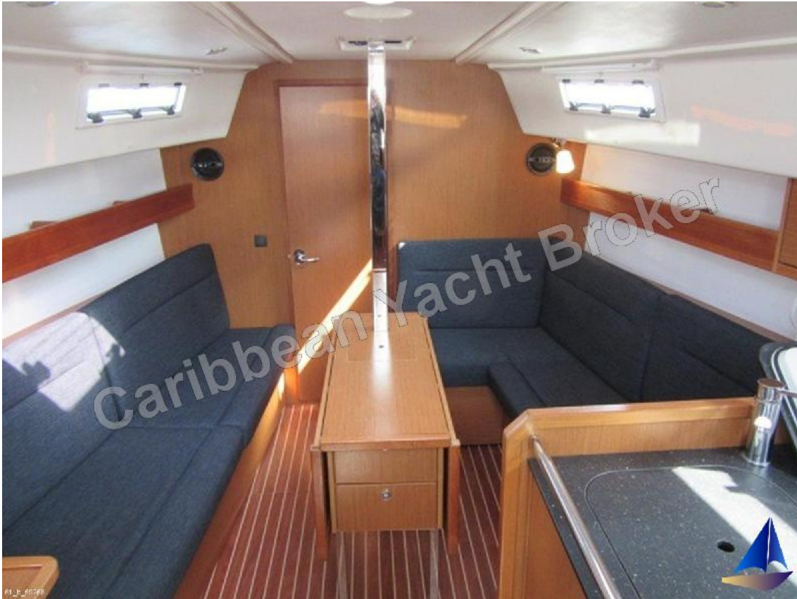
Navigation / Bavaria Cruiser 32 - 2012