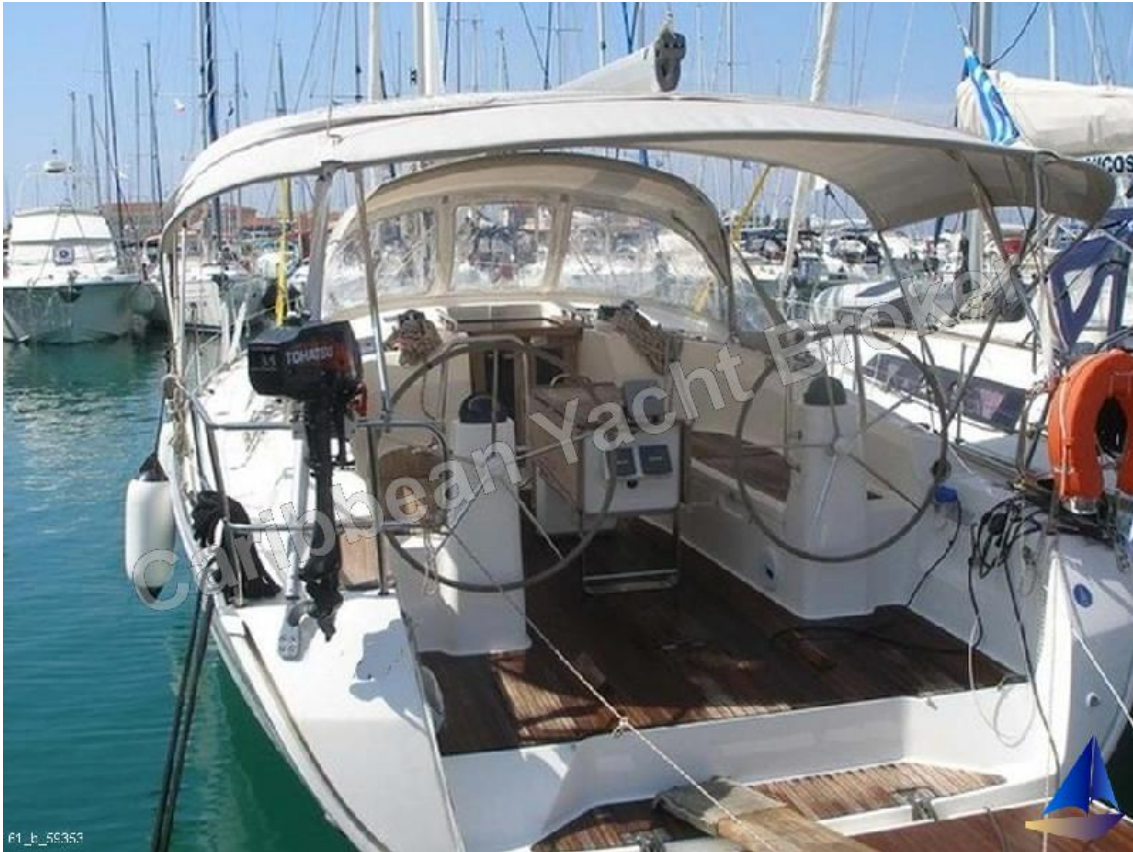
Salon / Bavaria Cruiser 40 - 2011