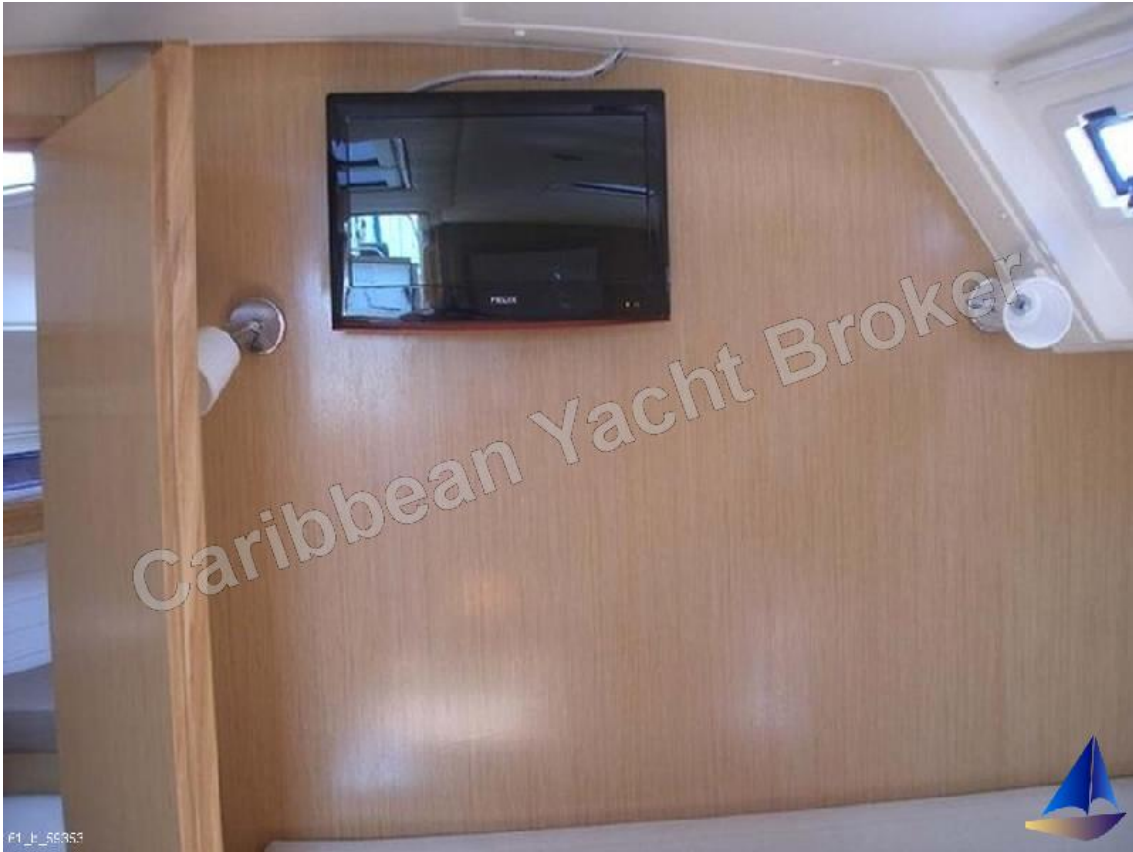
Cabin / Bavaria Cruiser 40 - 2011