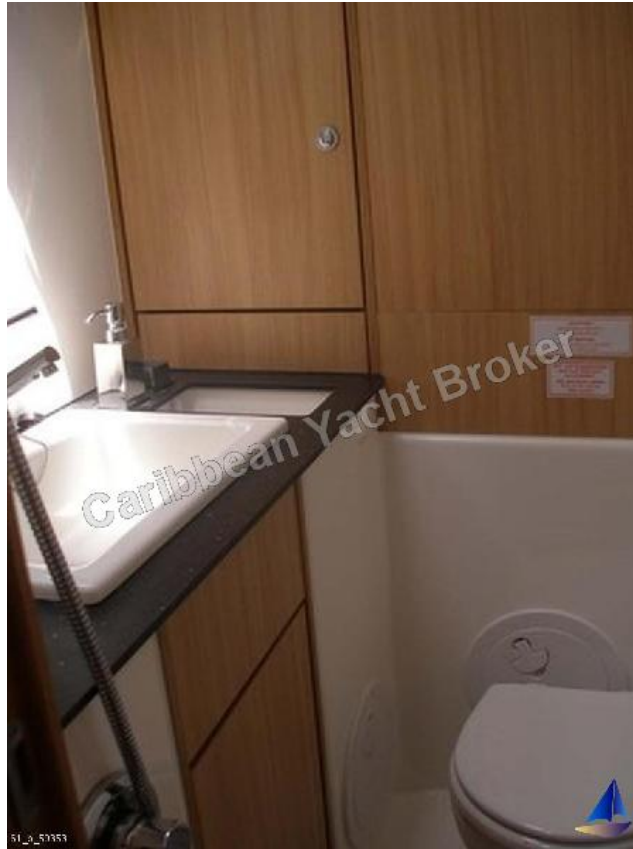
Layout / Bavaria Cruiser 40 - 2011