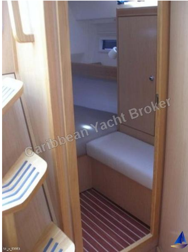
Bath / Toilet / Bavaria Cruiser 40 - 2011