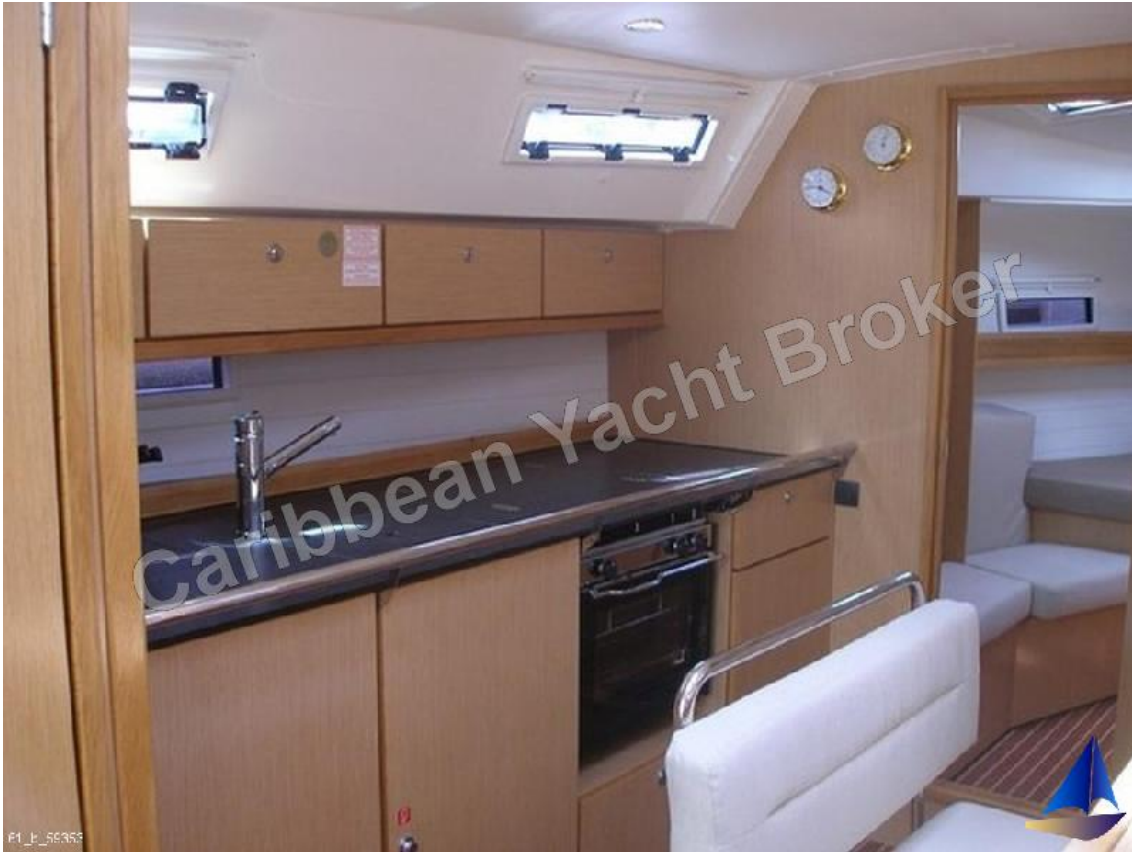
Navigation / Bavaria Cruiser 40 - 2011